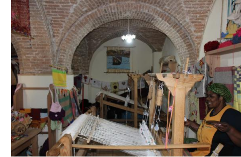
Immigrant weaving in a laboratory