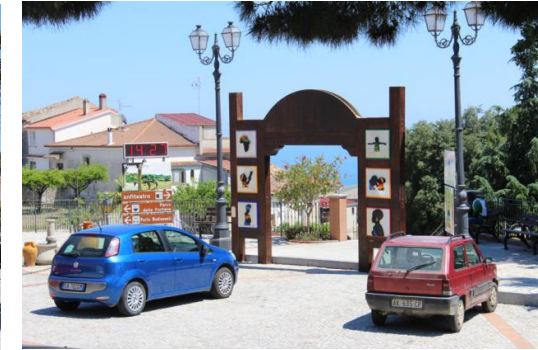
"Welcome to Riace", signs of welcome on the gate of Riace