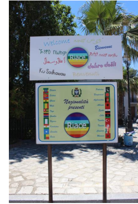
Public board showing nationalities present in Riace