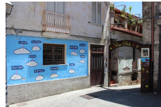
Mural painting and "Global Village", entrance arch to the shops