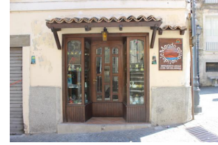
Boutique selling local handicrafts while promoting fair trade concept