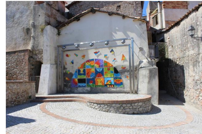
A small square in the historic centre transformed into a stage decorated with multi-ethnic paintings