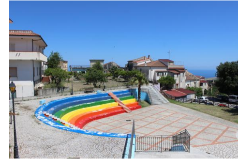
Theatre of Riace