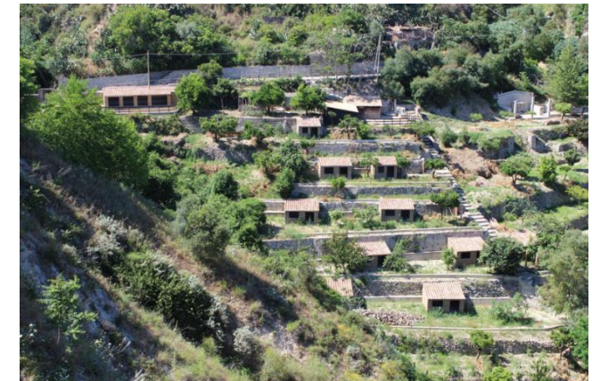
Panoramic view on the “Didactic Farm”