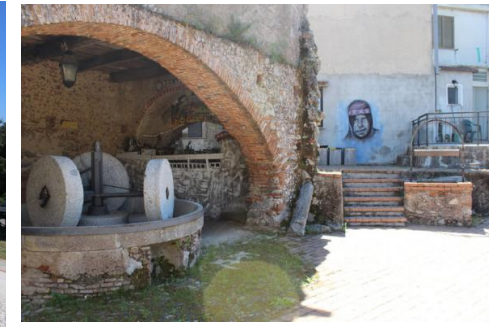
Oil mill with stone grinders for the production of extra virgin olive oil